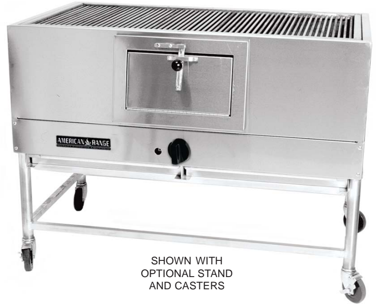
SHOWN WITH OPTIONAL STAND AND CASTERS

American Range provides as standard many of the optional upgrades normally offered at a premium on other Mesquite Wood Broiler lines. The new look features a stainless steel front and sides. Located on the front of the broiler is a large chute for easy loading and moving of wood and charcoal during operation. A built-in gas log lighter eliminates the need for messy lighter fluids or electric starters and can be used during "peak" periods. The American Range Mesquite Wood Broiler enhances the flavor of meat, fish and poultry with the unique flavor of mesquite. The broiler makes mesquite broiling convenient and efficient. The unique open grate bottom allows a continuous updraft of air for optimal fuel combustion saving wood and charcoal costs. The heavy duty cast iron grates make attractive broiling marks to add appetite appeal.