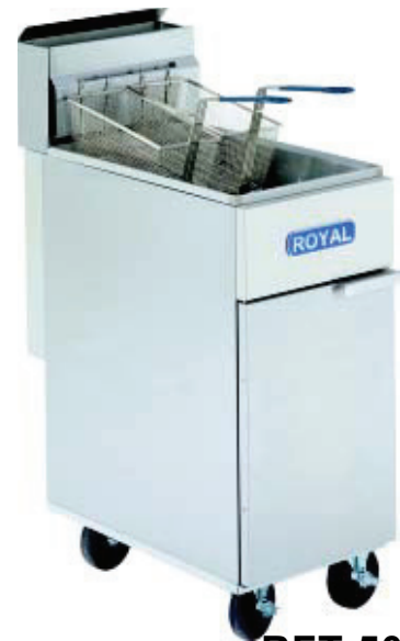
RFT-50 Shown On Optional Casters