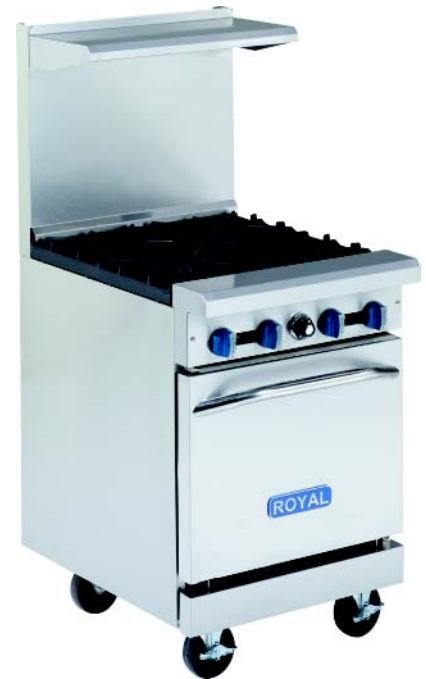
RR-4 Shown With Optional Casters

Royal Restaurant ranges have been designed to give the most useful features at an affordable cost. All stainless steel sides, and front panels, including the oven doors and kick plate are easily cleaned and rugged enough to withstand the constant heavy usage of a busy kitchen. Oven interiors are porcelain coated on all contact surfaces for fast and easy cleanup. The ovens are thermostatically controlled with 100% safety on the pilots to shut off the oven gas flow if the flame should go out. There is a push button ignitor for easy lighting of the oven pilot. 12" x 12" heavy cast iron grates cover the unique two piece lift off burners, rated at 30,000 BTU/hr. each.